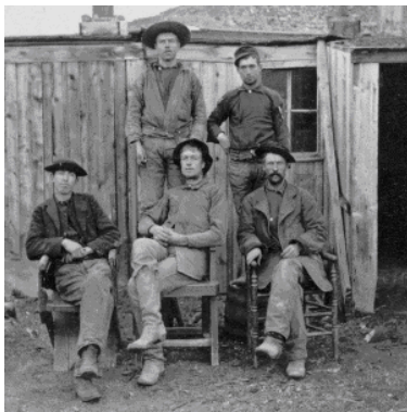
Montgomery miners 1880s

The Park County Local History Archives is a 501 (c)3 non-profit organization